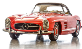
Mercedes-Benz 300 SL Roadster (W 198) produced in 1957

Further information: https://mb4.me/1Eh4rRnc