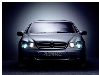
Mercedes-Benz CL 600 model series 215