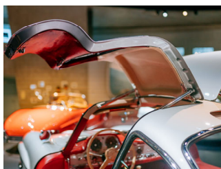
Mercedes-Benz 300 SL Gullwing (W 198)

Further information: https://mb4.me/d9y4cWlg