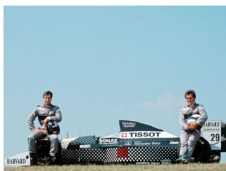
Sauber-Mercedes C 13 Formula One racing car of 1994

Further information: https://mb4.me/45jD0AtO