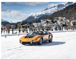
Mercedes-Benz C 111 with V8 engine

The part of the month is only one part of many, which are permanently reproduced by Mercedes-Benz Classic, as the all-encompassing and long-term supply of parts for all classics has top priority for us. Our corporate sales and logistics network guarantees the supply with our genuine Classic parts for your car anywhere in the world and thus they can be ordered from any authorized Mercedes-Benz dealer. Information about availability and prices can be found on our online parts search www.mercedes-benz.com/classic-parts which is updated regularly. There you can also make selections as for reproduced or promotion parts or you can order parts from the online shop (with delivery only to Germany).