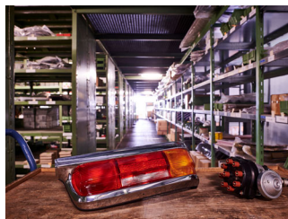
Mercedes-Benz Classic Online-Teilesuche