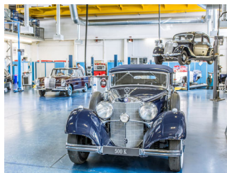
Mercedes-Benz 500 K (W 29)