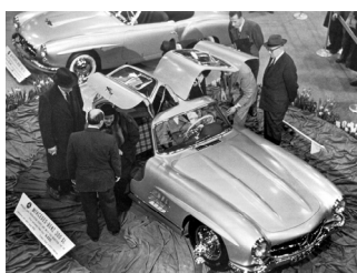
International Motor Sports Show in New York, 6 to 14 February 1954

Further information: https://mb4.me/Vvs3fGKL